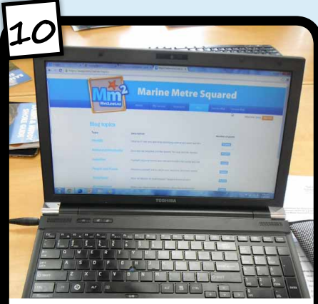
Back in the classroom we logged onto the Mm<sup>2</sup> website and added a new Soft Shore survey. We entered the data from our fieldsheet, added some photos and a post to the blog.