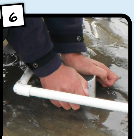
We pushed a tin can into the sediment to obtain a core sample, and then used a trowel to dig it out. We collected four of these core samples per quadrat.