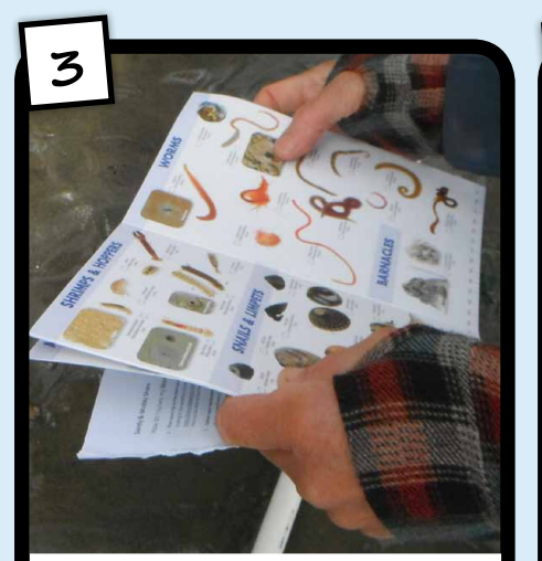
The Sandy & Muddy Shore Guides were extremely helpful. It was a good thing they were printed on waterproof paper!