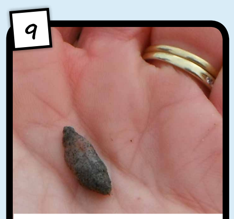
We saw some fascinating creatures, including crabs, a ghost shrimp, snails, whelks, limpets, wedge clams, cockles and worms. Our most surprising discovery was this super-smelly sulphur worm!