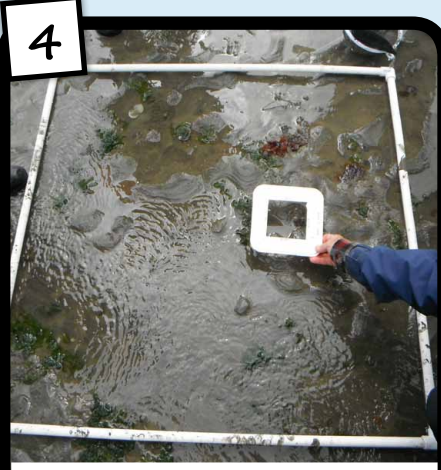
We estimated percentage cover of each seaweed species using the lid of an icecream container which had a hole cut out of it to represent 1% of the quadrat