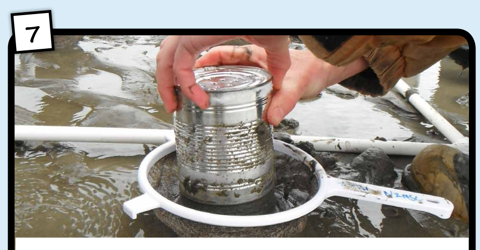
We carefully emptied the contents of each can into a sieve and looked for any signs of black, anoxic sediment (the RPD layer). We also measured the depth of the RPD layer below the surface. See page 7 for more info on the RPD layer.