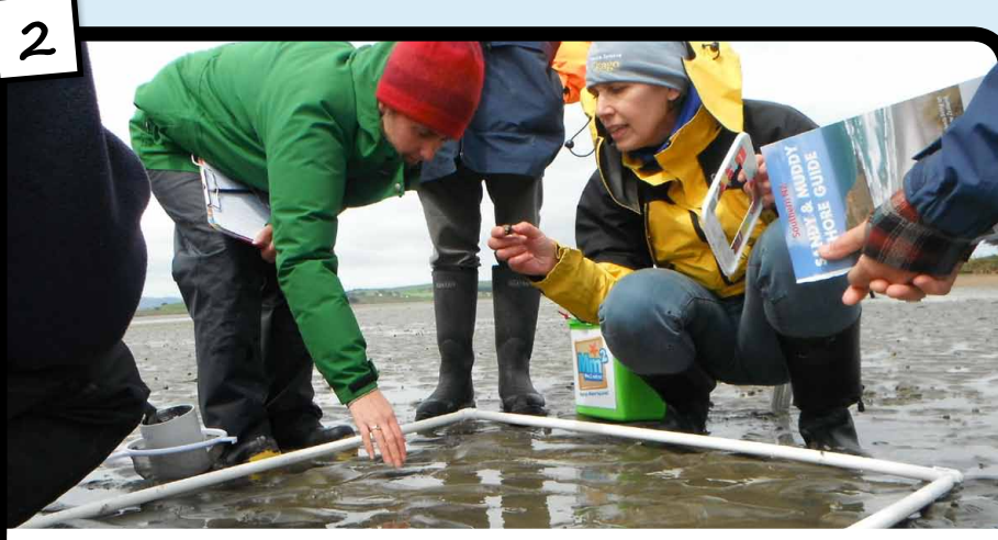
We identified and counted all of the animals we could find living on the surface (epifauna)